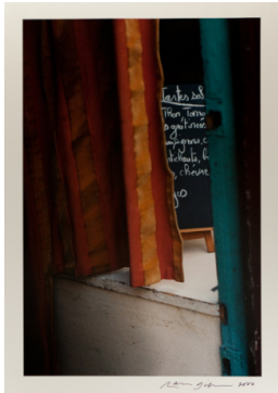
Title: Left Bank Bistro Menu, Paris, France Date: 2000, printed c. 2002 Primary Maker: Ralph Gibson Medium: Chromogenic color print