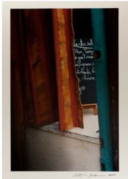
Title: Left Bank Bistro Menu, Paris, France Date: 2000, printed c. 2002 Primary Maker: Ralph Gibson Medium: Chromogenic color print