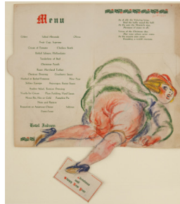
Title: Woman Sprawled on the Floor Date: c. 1930 Primary Maker: John Sloan Medium: Colored crayon and ink on paper