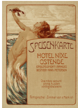
Title: Speisenkarte: Hotel Nixe Ostende Date: c. 1895 Primary Maker: Max Wulff Medium: Commercial lithograph