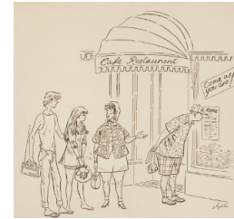
Title: Come As You Are Date: not dated Primary Maker: Constantin Alajálov Medium: Ink and gouache on wove paper