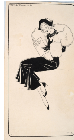
Title: Gold diggers usually get their start in the meal order business Date: 1930 Primary Maker: Faith Burrows Medium: Pen, ink, and wash on stiff paper