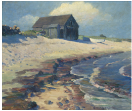
Title: Boathouse on the Beach (Horseneck Beach, Massachusetts) Date: 1916 Primary Maker: Clifford Warren Ashley Medium: Oil on canvas