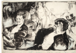
Title: Gentleman's Lounge Date: October 1901 Primary Maker: Rose O'Neill Medium: Ink and wash on paper with blue pencil