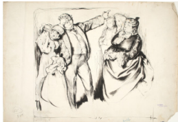
Title: He spoke of the sanctity of the home Date: 1904 Primary Maker: Rose O'Neill Medium: Ink on paper