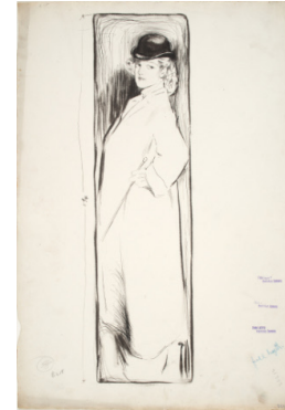
Title: "Her gilded head was tight and trig under the little derby," Date: 1904 Primary Maker: Rose O'Neill Medium: Ink and wash on paper