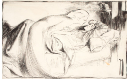
Title: A forever frustrated kiss Date: 1904 Primary Maker: Rose O'Neill Medium: Ink on paper