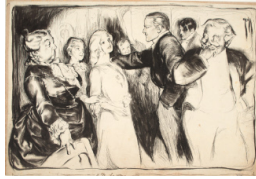
Title: Confrontation at social event Date: 1904 Primary Maker: Rose O'Neill Medium: Ink and wash on paper mounted on board