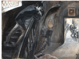
Title: (He) stared indignantly up Date: 1904 Primary Maker: Rose O'Neill Medium: Watercolor and gouache on paper mounted on board