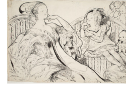
Title: Fancy mother and daughter Date: September 1913 Primary Maker: Rose O'Neill Medium: Ink and graphite on paper