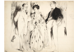
Title: His Uncle brings a present to little Johnny Date: April 5, 1905 Primary Maker: Rose O'Neill Medium: Ink on paper