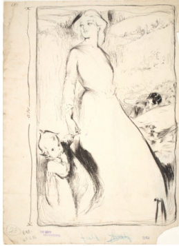
Title: All golden in a golden day Date: 1904 Primary Maker: Rose O'Neill Medium: Ink on paper