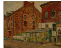
Title: Street scene with brick buildings and small frame house Date: not dated Primary Maker: Arthur E. Becher Medium: Oil on canvas