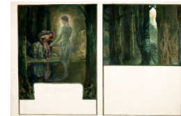
Title: Illustration for The Lonesome Place Date: 1923 Primary Maker: Arthur E. Becher Medium: Oil on illustration board