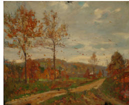
Title: Autumn landscape with road and mountains Date: not dated Primary Maker: Arthur E. Becher Medium: Oil on canvas