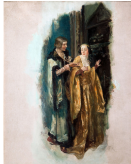
Title: Illustration for The Country of Two Kings Date: 1921 Primary Maker: Arthur E. Becher Medium: Oil on canvas