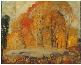
Title: Autumn landscape Date: not dated Primary Maker: Arthur E. Becher Medium: Oil on canvas