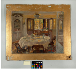
Title: Interior scene of dining room Date: not dated Primary Maker: Arthur E. Becher Medium: Oil on canvas