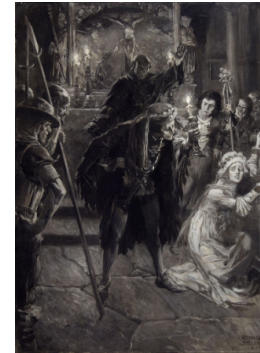
Title: But the intruder seized a candle from the chancel, and held it up before the frightened maiden's eyes, for Monsieur Bluebeard Date: 1914 Primary Maker: Arthur E. Becher Medium: Black and white oil on canvas