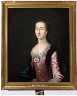
Title: Ann Inglis Date: c. 1757 Primary Maker: Benjamin West Medium: Oil on canvas