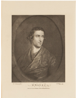
Title: Benjamin West Date: not dated Primary Maker: William Pether Medium: Mezzotint