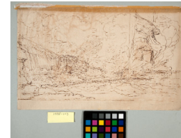
Title: Compositional Sketches Date: not dated Primary Maker: Benjamin West Medium: Ink on laid paper