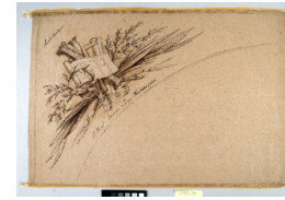
Title: Architecture, Queen's Lodge, Windsor Date: 1788 Primary Maker: Benjamin West Medium: Ink and bistre on laid paper