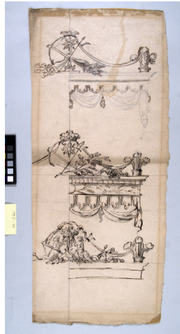
Title: Architectural Details Date: not dated Primary Maker: Benjamin West Medium: Ink and graphite on laid paper