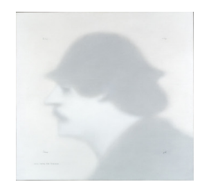
Title: The Substance of Natural Things is One

Primary Maker: Jack Whitten Medium: Canvas attached to wood board with wood elements painted with acrylic; welded steel frame