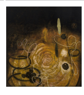
Title: Growth #2