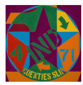
Title: Decade: Autoportrait 1964