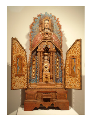
Title: Queen's Closet