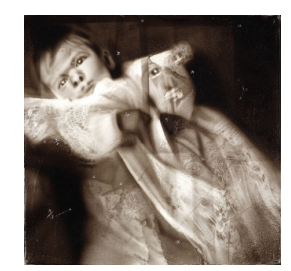
Title: "A x 3/N x 6 = 12""

Primary Maker: Donald Sultan Medium: Graphite and vinyl asbestos tile on wood