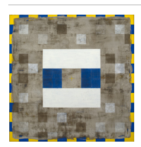
Title: Untitled 93-05 (Blue)