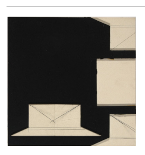
Title: Hats Date: 1979

Primary Maker: Donald Sultan Medium: Graphite and vinyl asbestos tile on wood