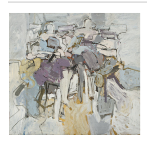
Title: Two Seated Figures