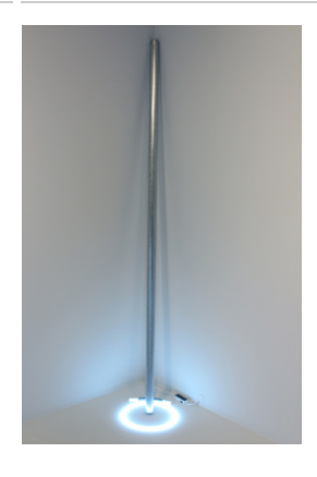
Title: Neon Corner