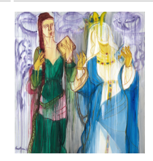
Title: Eleanor of Aquitaine Date: 1983