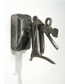
Title: We Know Date: 1986 Primary Maker: Melvin Edwards Medium: Welded steel