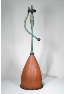
Title: Bell for Cheena Ireli Date: 1990 Primary Maker: Tyrone Mitchell Medium: Wood with black and red stain and green acrylic