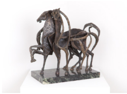
Title: Three Horses Date: c. 1957 Primary Maker: John Rhoden Medium: Bronze