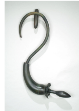
Title: Nature/Culture /Blues Date: 1991 Primary Maker: Tyrone Mitchell Medium: Carved and joined wood with black and green stain and magenta paint